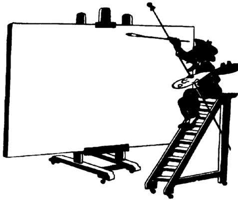
Figure 1.1 Some kind of illustrations or diagrams

achieve the best possible result. The list is not presented in any order of priority, but focuses on three areas that the examiner is likely to focus on: